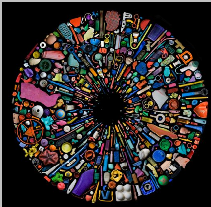
Mandy Barker, SOUP

She focuses on the representation of material debris in the sea and more recently on the mass accumulation of plastic in the oceans. Her work is made up of found objects or garbage on the sea shore.