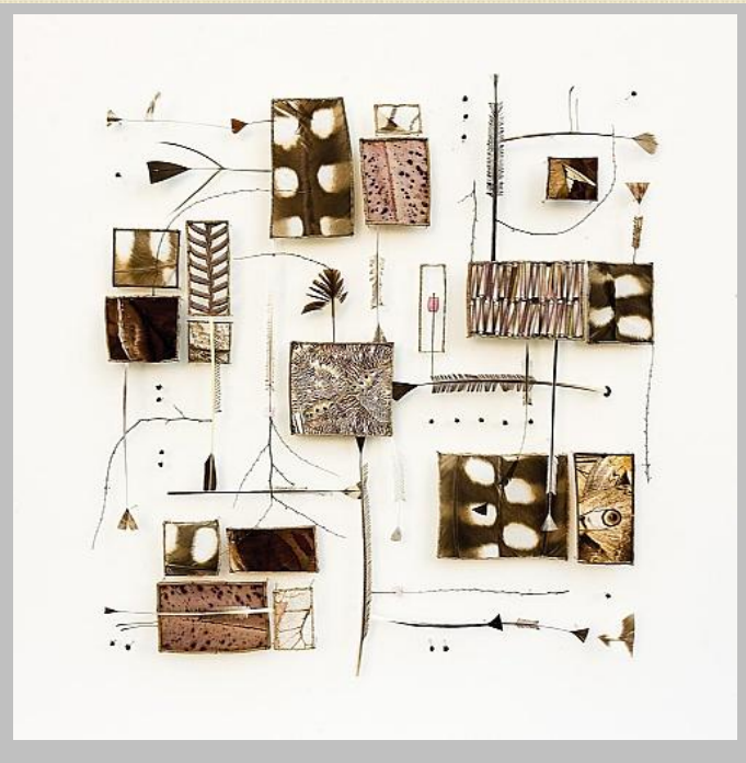
Gathering No. 7 (55 x 55 x 7 cm) Feathers, wings, leaves, seedpods and fish egg carapace

Shona Wilson is a contemporary Australian sculptor who uses found objects, bronze casting, ceramics, and natural materials to create representational 2D and 3D assemblages . Her work raises awareness about pollution that incorporates nature, humans, and culture combined. She became inspired to begin her work when she discovered that plastic particles are now found inside plankton , revealing how much of an influence mankind can have on nature. Much of the materials she collects from nature is dependent on the season and what is available.