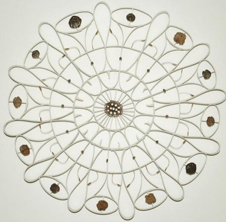
Interlace No. 12, 2011 Found mixed media 36x36x2cm